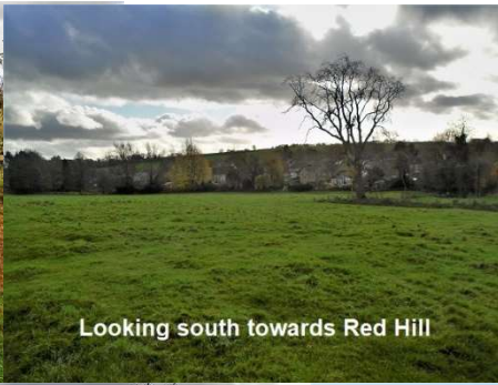
Looking south towards Red Hill