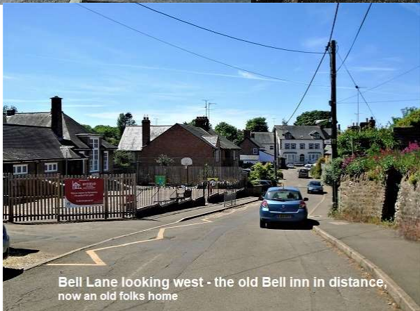
Bell Lane looking west - the old Bell inn in distance, now an old folks home