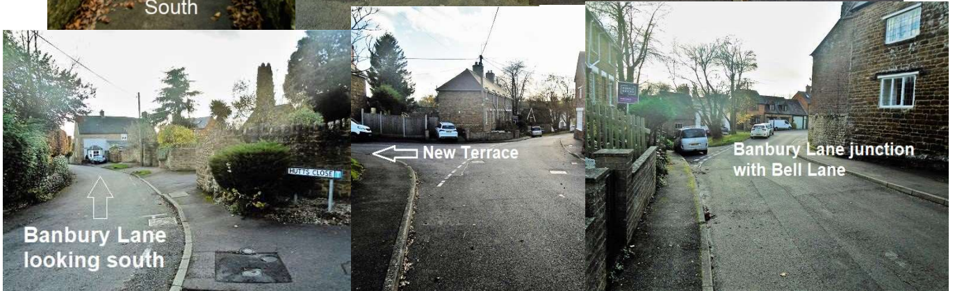
↑ Banbury Lane looking south