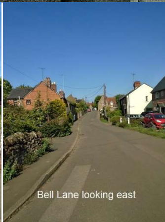
Bell Lane looking east