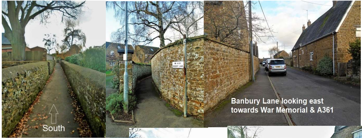
Banbury Lane looking east towards War Memorial & A361