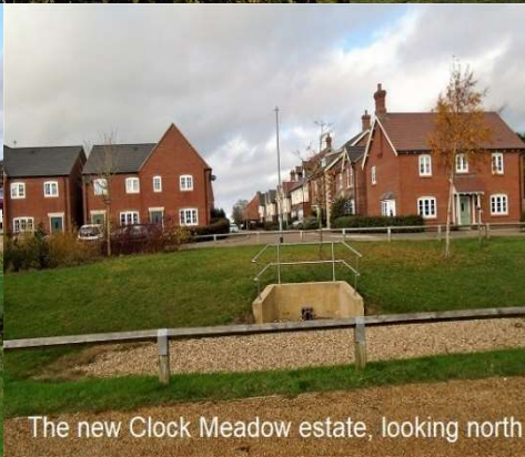
The new Clock Meadow estate, looking north