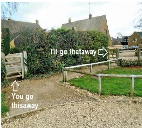
You go thisaway