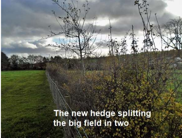
The new hedge splitting the big field in two