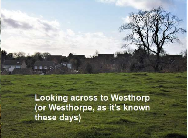
Looking across to Westthorp (or Westthorpe, as it's known these days)