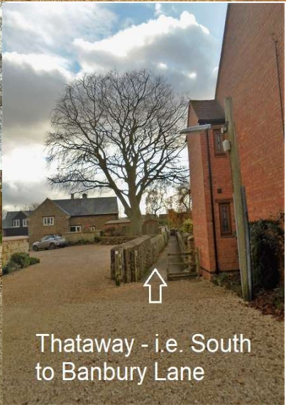
Thataway - i.e. South to Banbury Lane