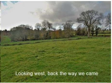
Looking west, back the way we came